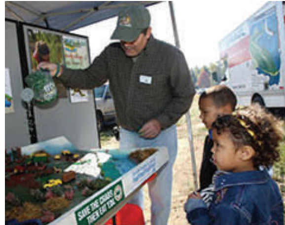
Rain on a watershed model.