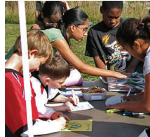
Play games and solve puzzles.